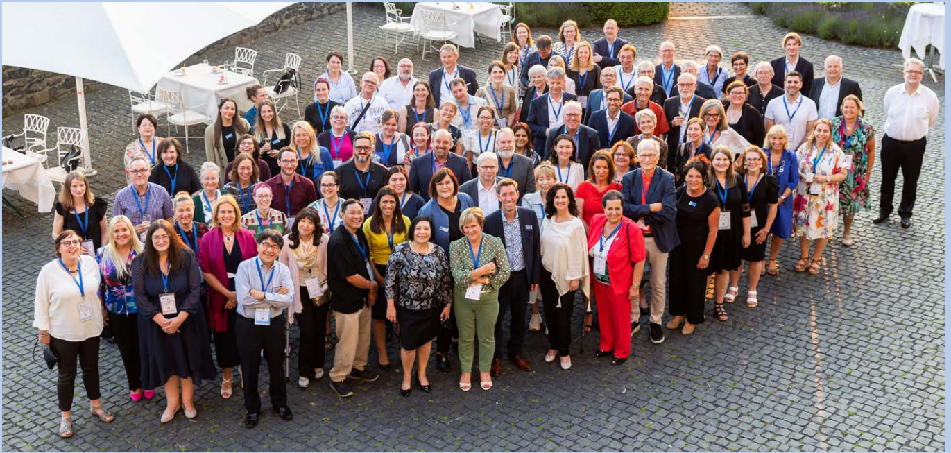
Event Petersberg 2023

I myself only took over the management of the exposure course in 2008. In 2023, we celebrated the 25 th anniversary of the training courses with a high-caliber scientific symposium.