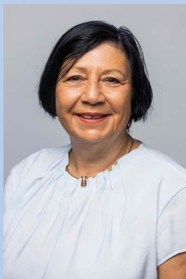
Birgit Huber ©IKW

Safety assessors fulfill an important task. They evaluate cosmetic products with regard to their safety for human health before the products are placed on the market. Safety assessors are responsible for ensuring that the product meets all legal requirements with regard to safety to human health under intended and reasonably foreseeable use conditions.